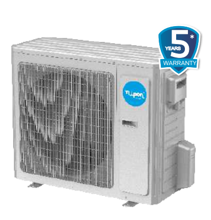
* 3 years full warranty + 2 years warranty only parts